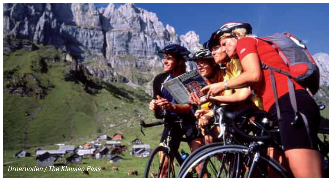
Urnerboden / The Klausen Pass