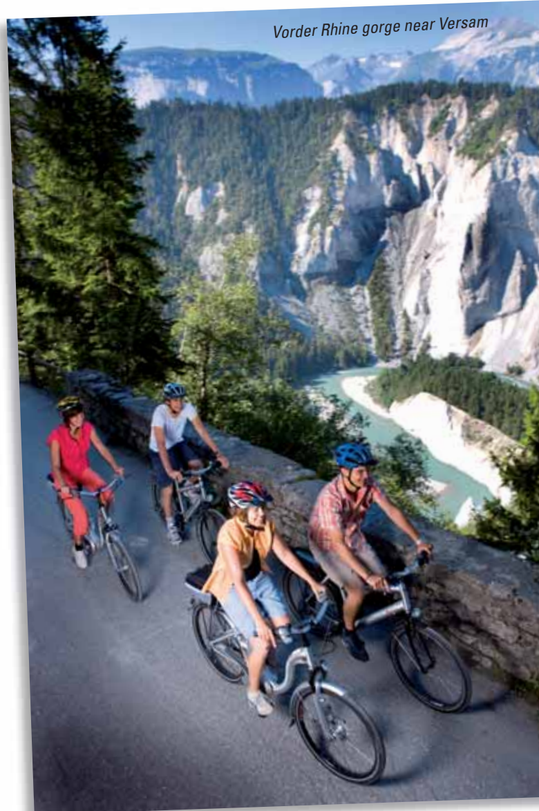
Vorder Rhine gorge near Versam

Stein am Rhein is located at the point where the Rhine issues from the Untersee. You must make time for this little nugget, before tackling the last stretch towards Schaffhausen. Starting at the Rhine Falls, the mightiest waterfall in Europe, the route passes through fascinating riverside landscapes and fertile territory where even asparagus is grown. The pretty riverside villages of Eglisau and Kaiserstuhl are worth a visit, and at the town of Bad Zurzach, relaxation awaits the cyclist at the pretty hotel «Zunftaus zur Waag» and in the neighbouring hot springs.