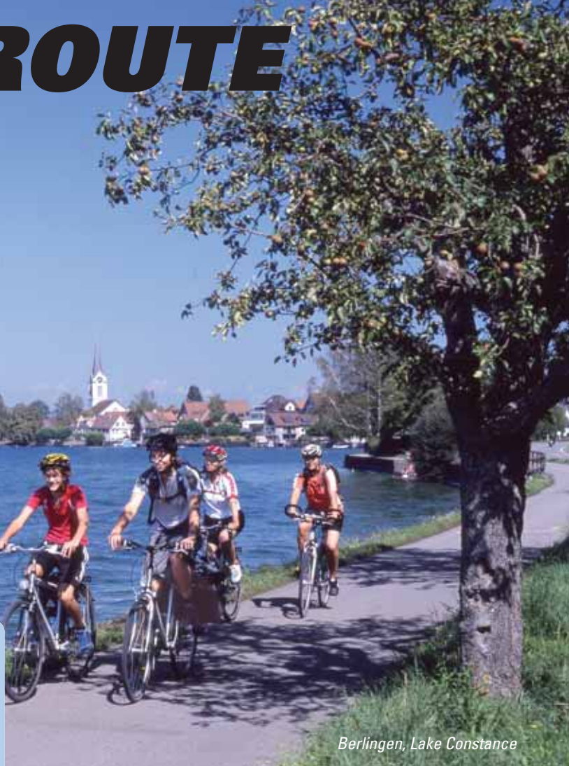
Berlingen, Lake Constance