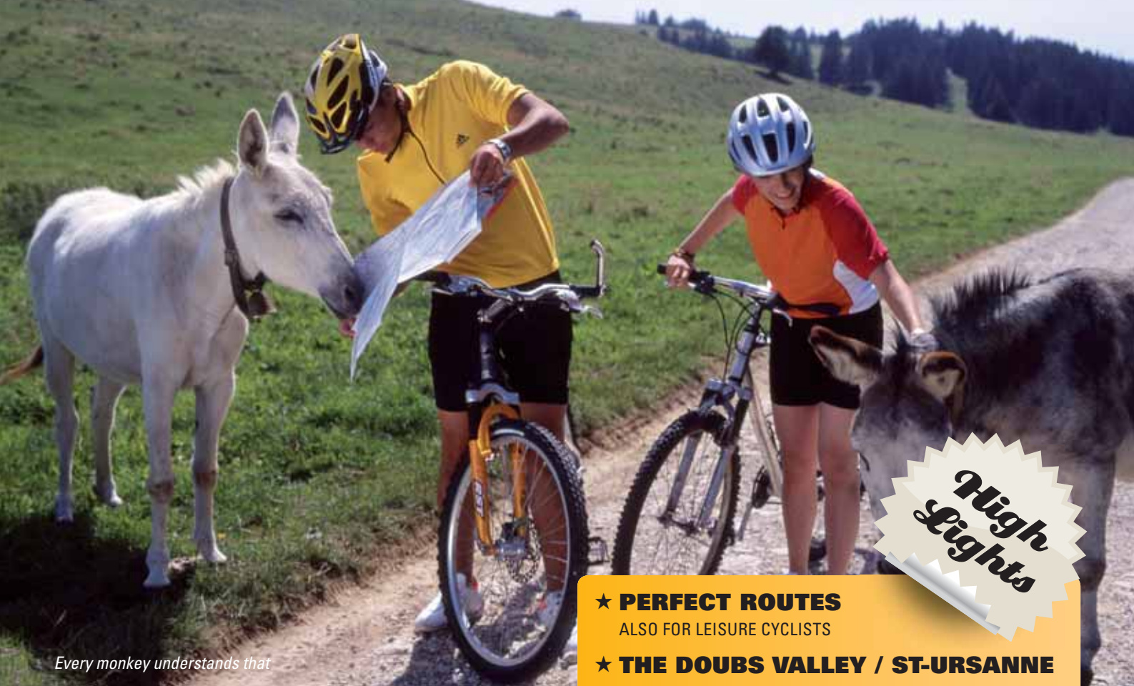
Every monkey understands that